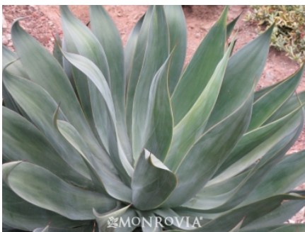
Agave shawii x attenuata 'Blue Flame' - Blue Flame Agave

Flax Lily : Handsome, strap-like, green and white-striped leaves that will brighten up garden beds and borders. The neat, clumping habit is ideal for massing as a groundcover. Delicate sprays of pale blue-violet flowers appear above the foliage in mid-spring; bright blue berries follow in summer. (Description from Monrovia)