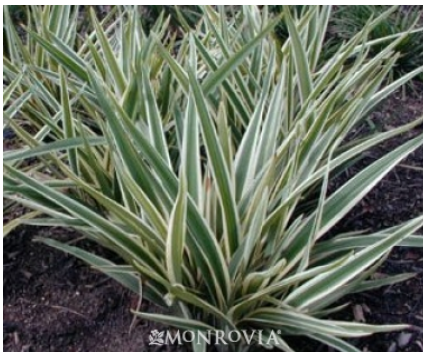
Dianella tasmanica 'Silver Streak' - Silver Streak

Flax Lily : Handsome, strap-like, green and white-striped leaves that will brighten up garden beds and borders. The neat, clumping habit is ideal for massing as a groundcover. Delicate sprays of pale blue-violet flowers appear above the foliage in mid-spring; bright blue berries follow in summer. (Description from Monrovia)