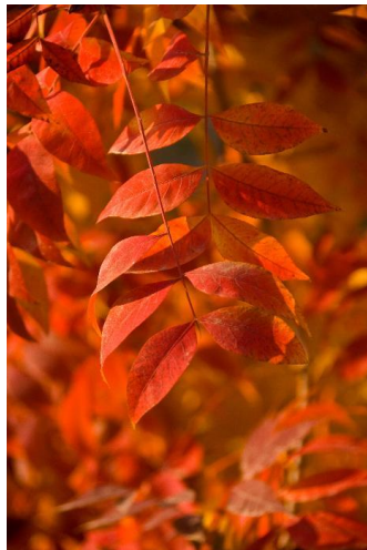
Pistache Chinensis 'Keith Davey' - Autumn favorite! - Deciduous tree - Turns orange-scarlet through autumn