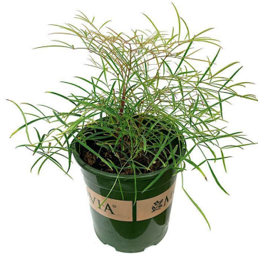
Nandina domestica 'Chime' - Threadlike leaves - Evergreen shrub - Turns orange/red in winter