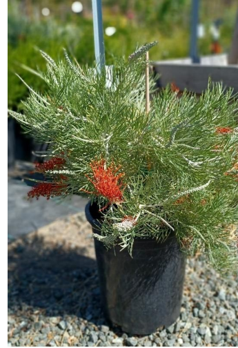
Grevillea 'King's Fire' - Released in 2016 - Silver-green shrub - Flowers throughout the year