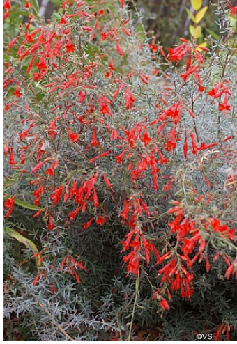
Epilobium canum 'Catalina' - California native - Silver foliage - Orange-red flowers late summer/early fall