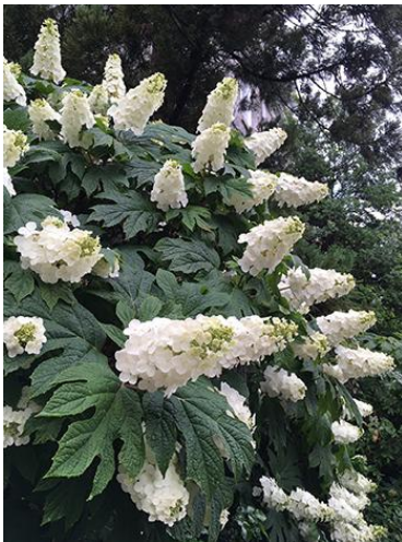
Hydrangea quercifolia 'Snow Queen' - Rich brown bark - Dark green leaves turn purple in winter