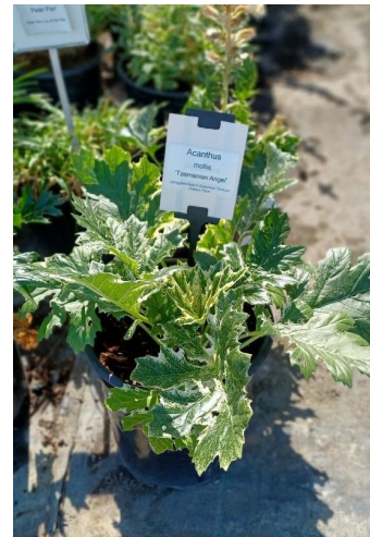
Acanthus mollis 'Tasmanian Angel' - White mottled leaves - Bold, coarse texture - Evergreen in warm winter climates